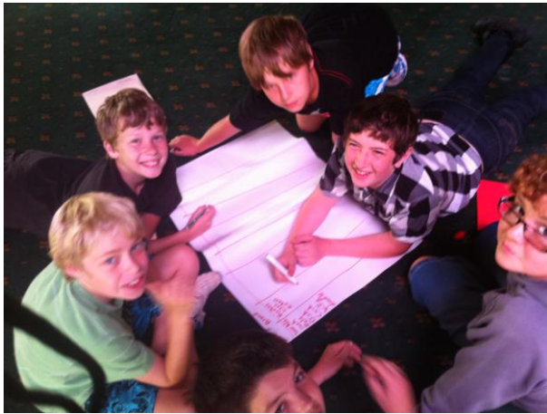
Students enjoying group work