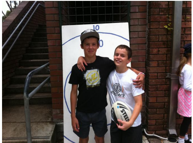
Best mates who ran a great target ball activity!