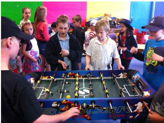
Fun, fun, fun.....