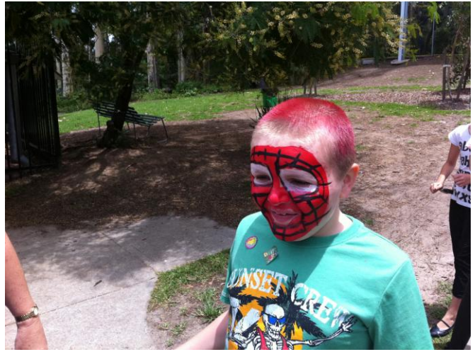
...and Spiderman was visiting for the day...and we don't